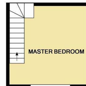
2ND FLOOR APPROX. FLOOR AREA 143 SQ.FT. (13.3 SQ.M.)

TOTAL APPROX. FLOOR AREA 881 SQ.FT. (81.9 SQ.M.)